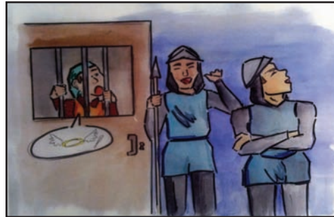
Scene from “The Rooster from Barcelos”