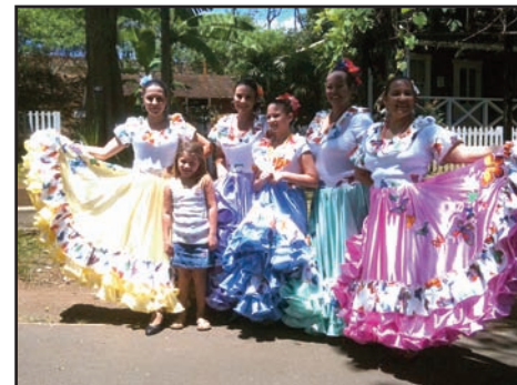
All types of traditional Puerto Rican dance and clothing will be on display.