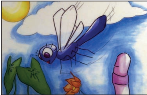
Scene from “Dragonfly & Earthworm”