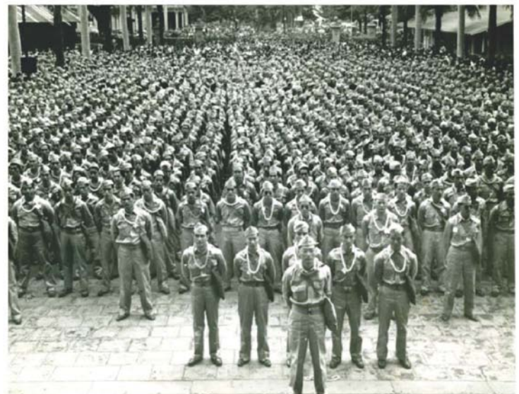
The 442 nd RCT at Iolani Palace prior to departure for training camp (March 1943)

"GO FOR BROKE - a 442 nd RCT Origins Story" is a historical movie of the 442 nd RCT. It follows a group of UH ROTC students during the year after the Pearl Harbor attack and their fight against anti-Japanese discrimination. To prove their loyalty, they formed the Varsity Victory Volunteers (VVV) to demonstrate their loyalty to defend Hawaii and gaining their right to bear arms. The bravery and actions of the men, families, and supporters, along with the perseverance of the original 100 th Infantry Battalion draftees, led to the segregated all-Japanese 442 nd Regimental Combat Team, the most decorated combat unit in U.S. history. The film was written by Stacey Hayashi, soundtrack by Jake Shimabukuro. Presented at the Hawaii International Film Festival 2017. Please attend the free showing of "Go for Broke" at 12:00 noon at the Jan. 6 Rice Festival.