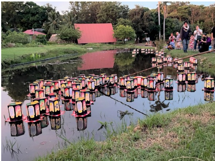
Lantern Floating Ceremony